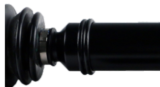
*Hollow Tube Design