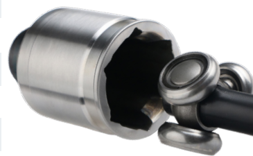
*AAR Socket Design