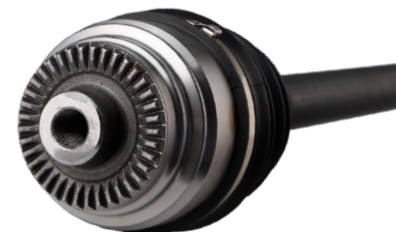
*European Flat Spline Design