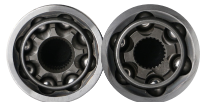
*6 & 8 Ball OE Socket Designs