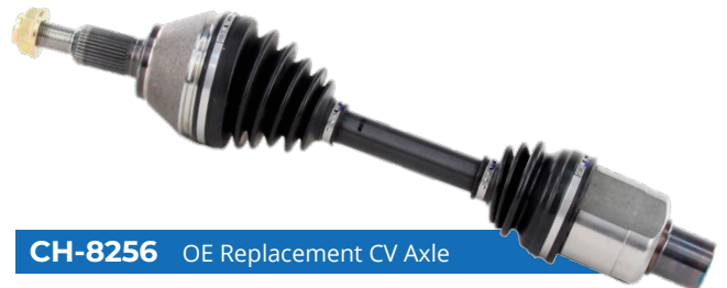
CH-8256 OE Replacement CV Axle

We strongly recommend replacing the CV Shaft with a new TrakMotive CH-8256, CH-8256HDX or CH-8256XTT when completing the job.